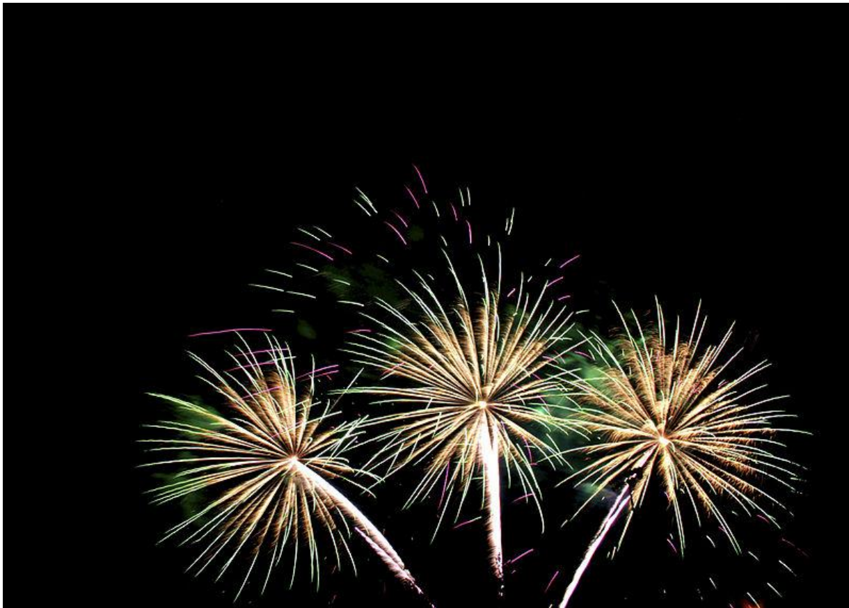
Photo taken by Kabir Bakie at Blue Ash Community Fireworks July 2005.

This file is licensed under the Creative Commons Attribution-Share Alike 2.5 Generic license.